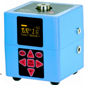
Figure 5: Vibration calibrator VC21

1 TEDS = Transducer Electronic Data Sheet Manfred Weber