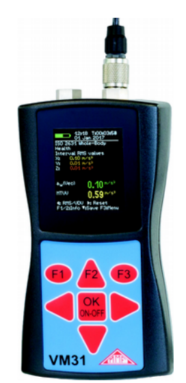
Figure 2: Vibration meter VM31